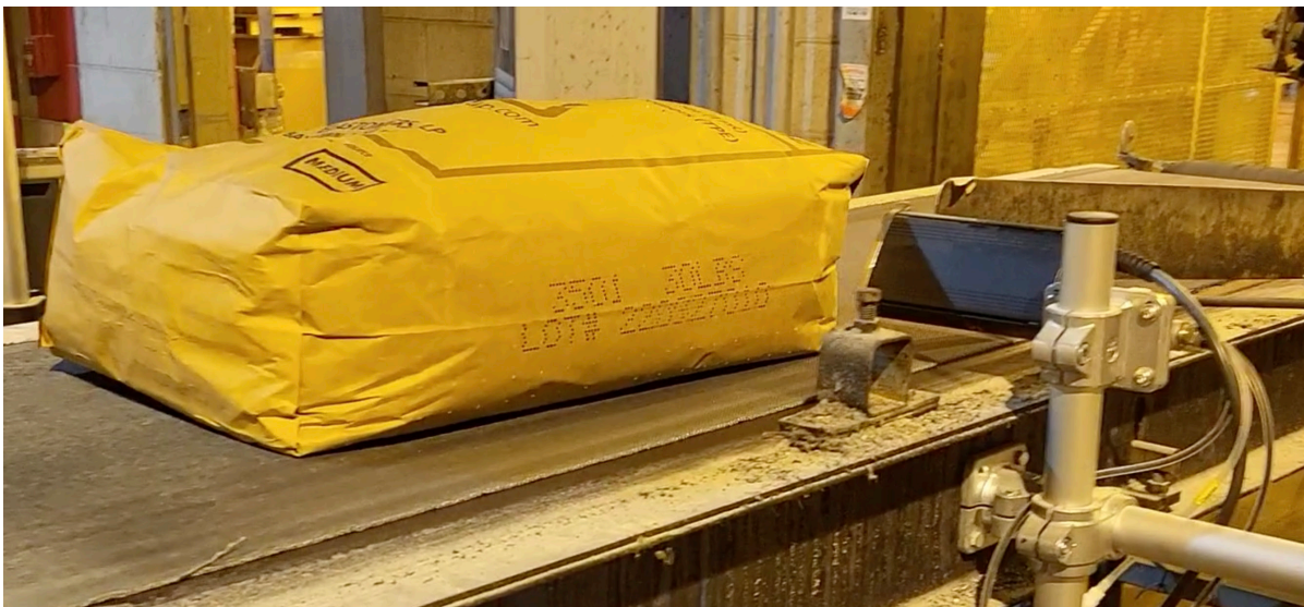
V-Series V16 marking industrial kraft bag with lot code and product data.

To modernize LCY's printing capabilities and make it possible for the company to easily scale their operations, ISSI installed the Matthews Marking VIAjet V-Series with an MPERIA® controller.