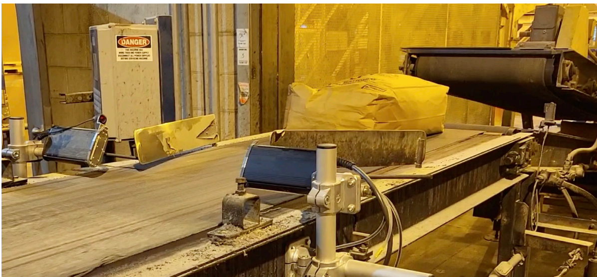
Two V-Series V16s on opposite sides of the production line marking LCY's industrial bags.

The V-Series is designed to deliver optimal ease of use with user-friendly hardware and software. The touchscreen MPERIA® controller provides an intuitive user interface that integrates seamlessly without specialized server software or hardware, and centralizes control of all marking and coding equipment across lines and across plants.